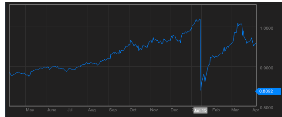
Figure 2: USD/CHF

floor not only the EUR/CHF rate has changed, but also the whole dynamic of the Swiss Franc with respect to any other currency. The Swiss Franc simply got stronger overall. Now the Swiss Franc can move freely, which wasn’t the case before due to the SNB’s interventions (as can be seen very clearly in figure 1).