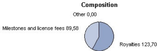
Figure 2: Composition Royalties/Milestone payments with 3 x USD 2,000 Mio sales.